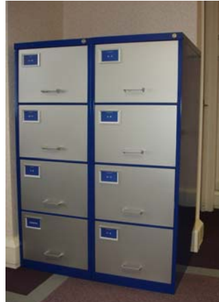
Existing filing cabinets were refurbished.