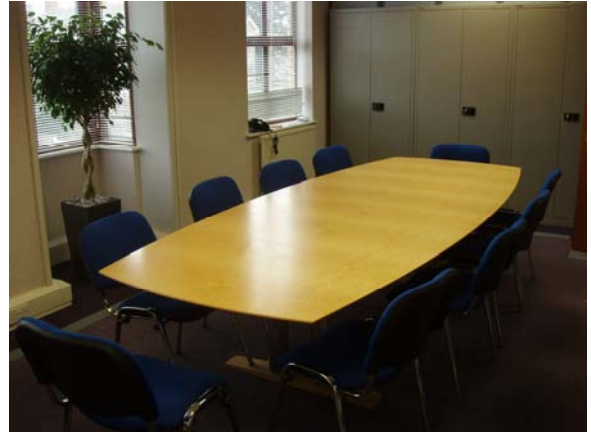
The office furniture, desks, and boardroom table are in excellent condition, but all are second-hand.