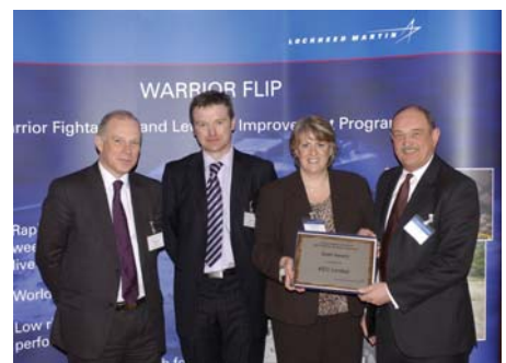
Gold Award for KEC

KEC's performance is underpinned by its ISO9001:2000 Quality Management System, which is maintained by Penarth Management.